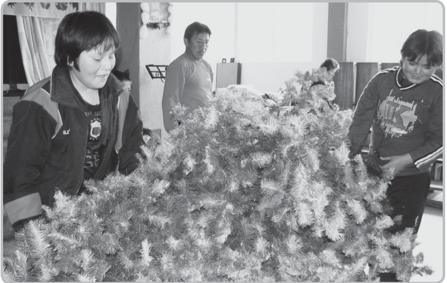
Everyone wants to help! The big brothers take care of carrying the Christmas tree at the Center.