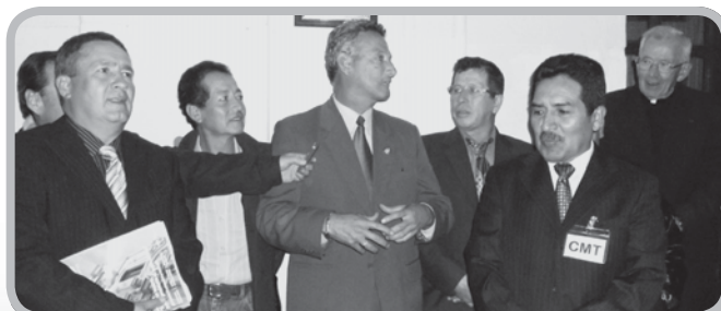
Many original WBC members gathered to celebrate, participate in the commemoration ceremony and assist in the unveiling of the plaque

best thing that ever happened in the recorded history of Ecuador, of the Jesuits and of the attic. Meantime, the unveiling of the plaque at the foot of the tower stairs drew a group of the original shoeshine boy members who came to help us take the tiny veil off the plaque. The disorder of having everybody getting two fingers on the tiny veil was like old times. A few tears were shed because, as they'll all tell you, the Center really is the best thing that has happened in their lives.