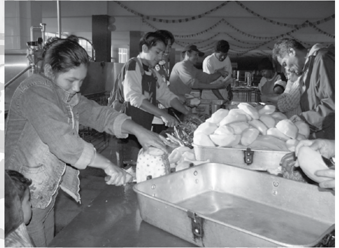
The "Volunteerism" program is the families' way of giving to each other.