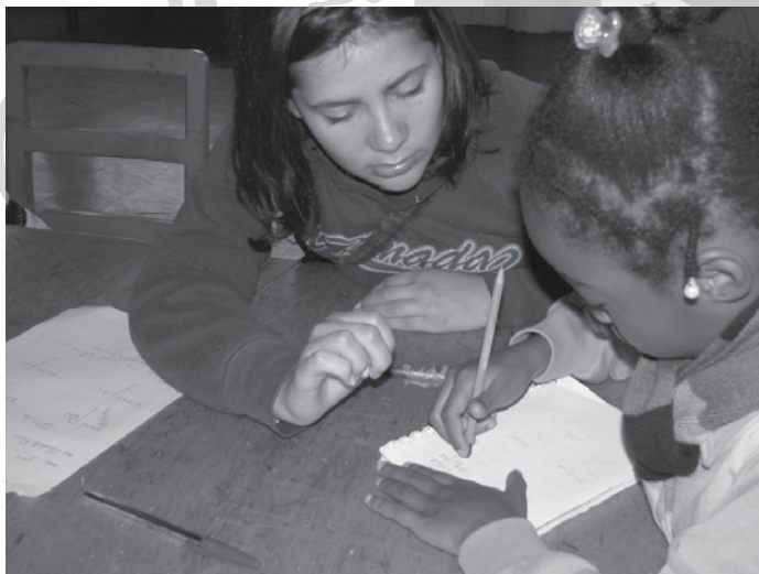
Even the teenagers learn to give back by helping the grade schoolers with their homework.