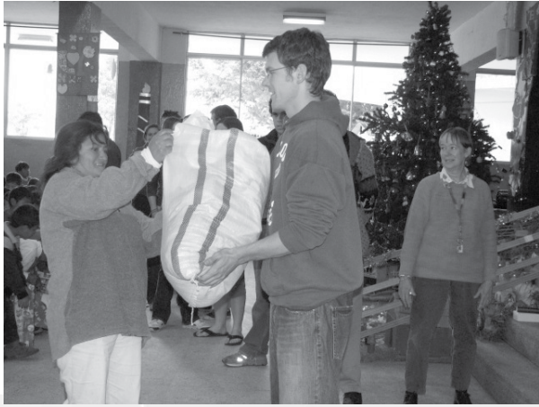
Benefactors' generosity makes possible the annual giving of Christmas bundles to each family.

Anyone who does not know the Working Boys' Center would have to wonder what fun there could be in reforming a whole life style that did not include studying, bathing regularly and making and keeping a budget with the objective of using the savings to build a "house" which is not a "room". These are all obligations that would seem to oppress them into self pity. But all the evident rooting for each other that drives the Center onward is the new game of life as God intended it to be, and as Jesus finds us at Christmas.