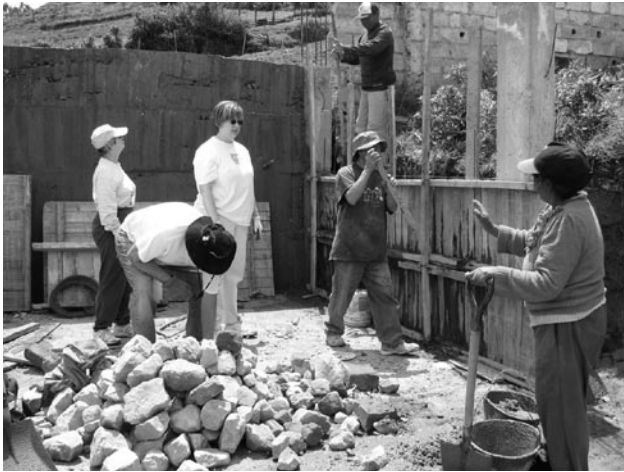
We call it the "Gringa Minga". Benefactors give time and money to help families build decent houses.

the message across. God had to come himself, as a baby, smiling forever at the folks enjoying all of the precious gifts in existence as God gives them. Then we would all get the pitch to smile and laugh and be generous with everybody.